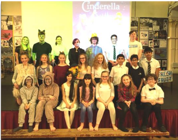
Porter's students on stage for their production of Cinderella - a worthy runner-up this year.