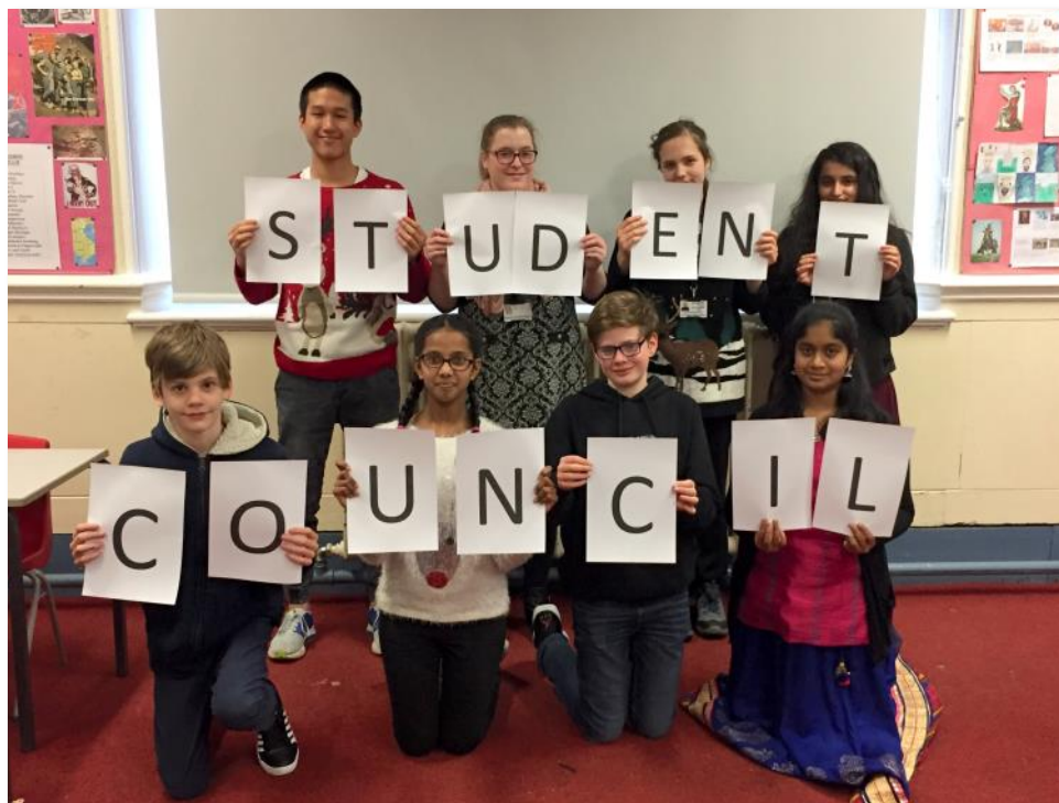
Some of our hardworking 2017 student council members