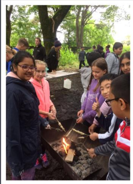
Y7 students enjoying baking bread sticks over an open fire

As part of their induction as new students to the school, our 2017 Y7 cohort spent the day taking