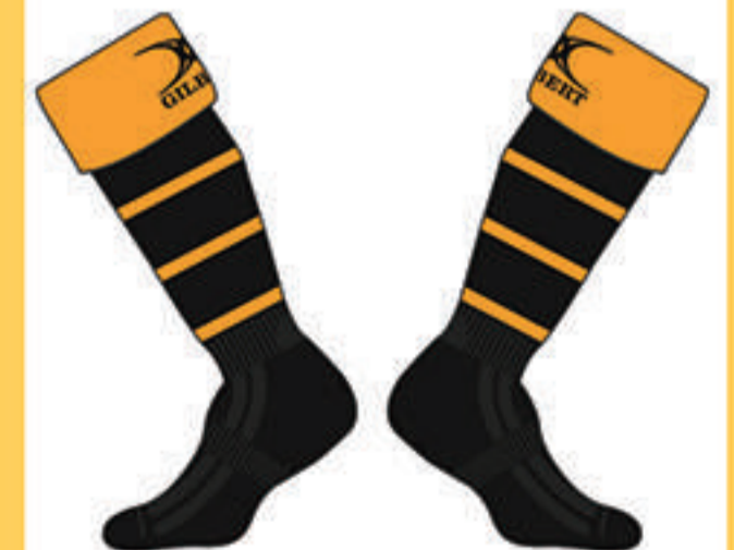
Match Socks £250