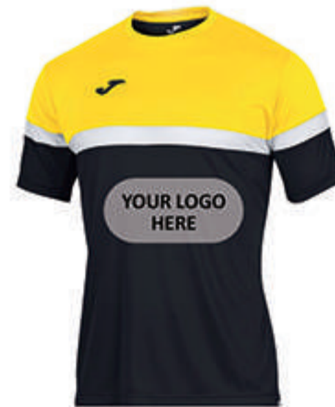
Match Shirt Sponsors available on chest, back and sleeves