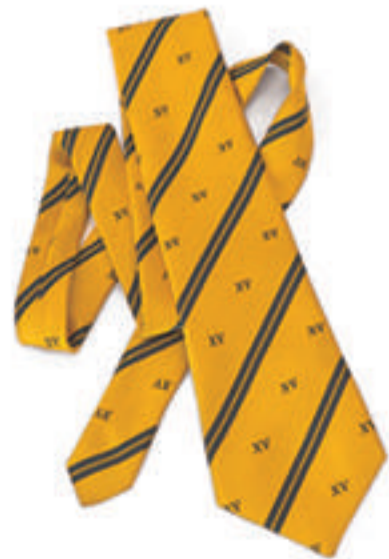
1ST XV Rugby Tie