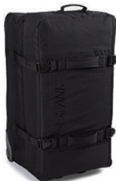
Travel Bag (For all tours) £4500