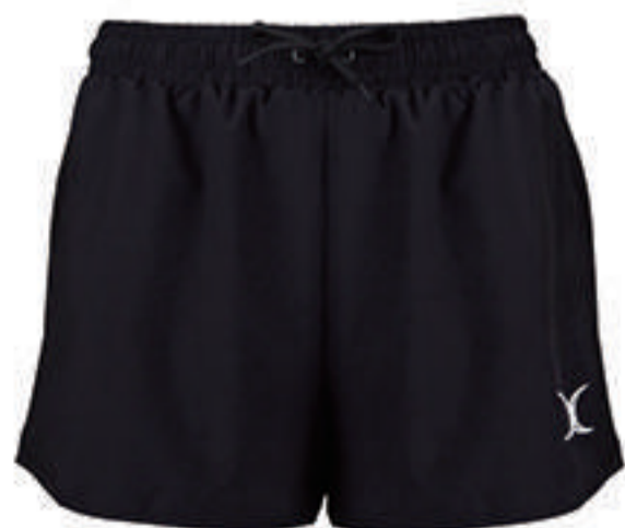
Training Shorts £700