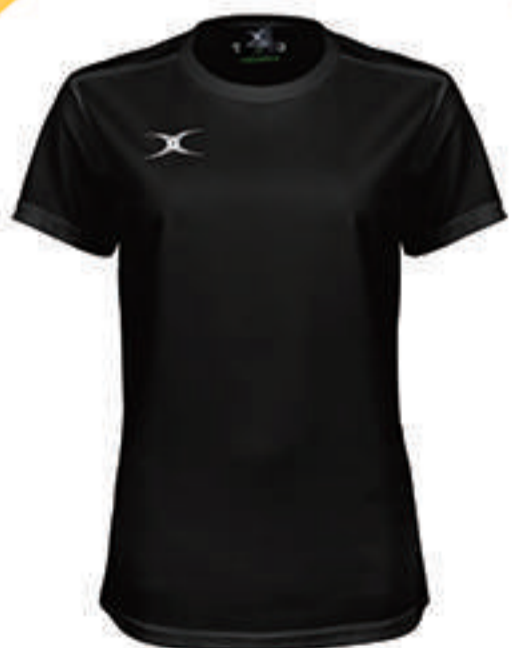
Training T-Shirt £650