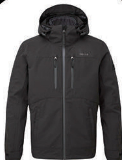
Waterproof Coat £1200