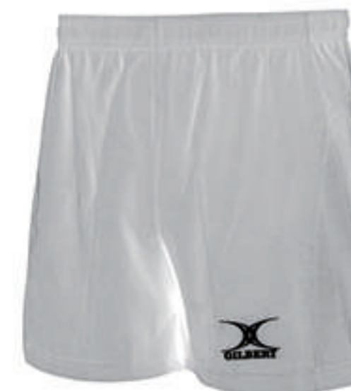
Travel Shorts £1200