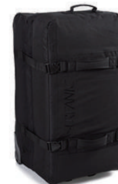
Travel Bag (For all tours) £4500