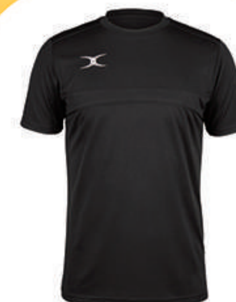
Football Training T-Shirt £650