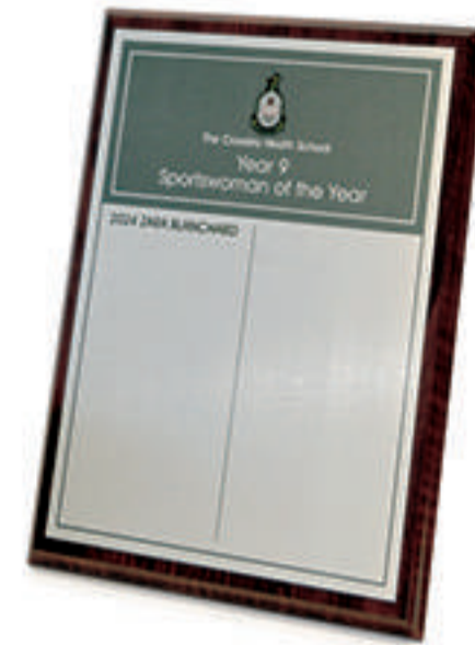
Sportsperson of the year award