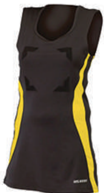
Match Dress (Front and back) £900