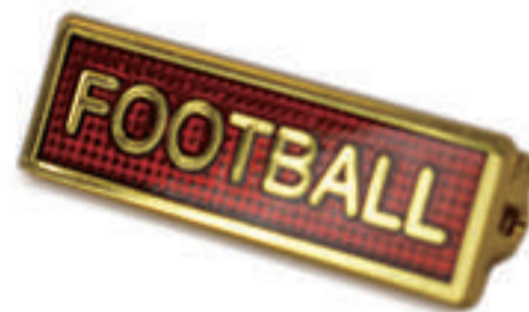
Sports Colours Badge