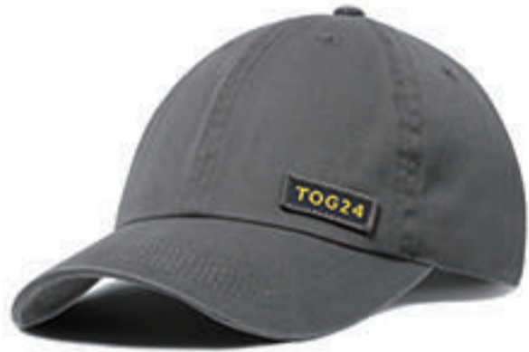
Players of the year Sports Caps