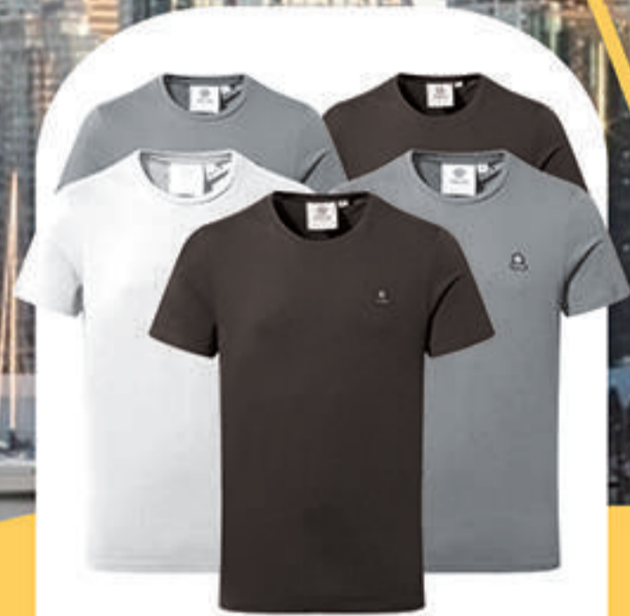
T Shirt x5 £800

RUGBY AND FOOTBALL TOURS TO CANADA, ITALY AND GLASGOW IN THE NEXT 12 MONTHS