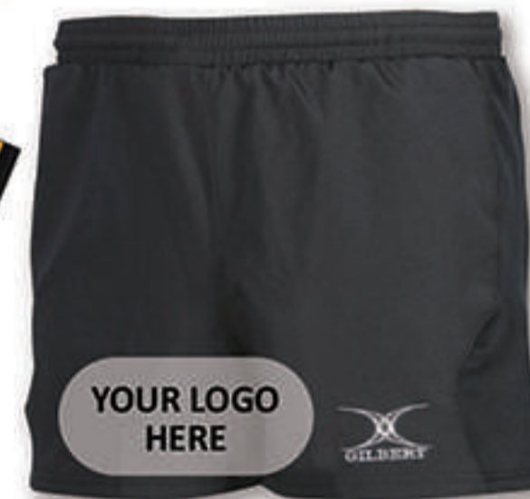
Virtuo Match Shorts £1000