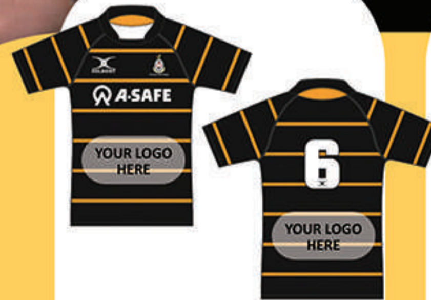
Match Shirt Sponsors available on chest, back and sleeves £2000